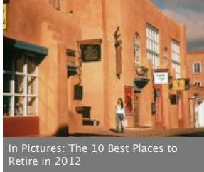
In Pictures: The 10 Best Places to Retire in 2012

Better weather, affordable housing, and plenty of interesting things to do are just a few reasons people move to retire. Whether you want to spend your golden years watching the sun set over the water or taking on a second ideal place. Using data from Onboard Informatics , U.S. News selected 10 key attributes that many people look for, along with a city that excels in meeting each need. Here are 10 excellent places to retire in 2012.